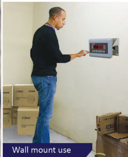
Wall mount use